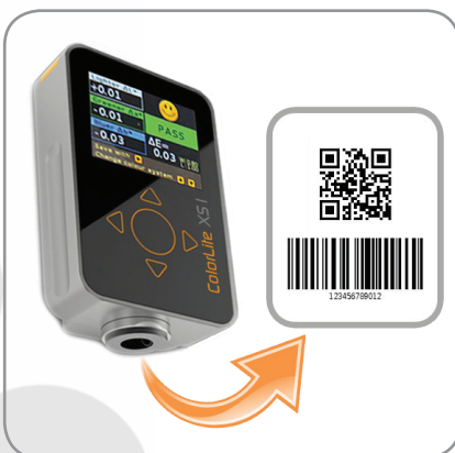
Integrated QR- and BAR-Code scanner for sample ID and name

The small sized instrument, made in Germany from a solid aluminium block, weighs just 270g. It is equipped with the latest high-definition technology allowing a high resolution spectral scan in 3.5nm steps in less than 1 second. The brilliant colour high contrast O-LED display makes a perfect user interface. The menu is simple and clear, so anyone can perform measurements fast and accurate. A further unique feature of the ColorLite XS1 is the integrated data-matrix and bar-code camera. This allows for fast effect sample identification and management.