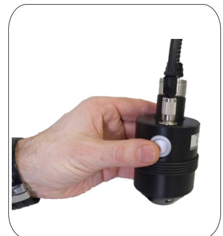
d/8° Messkopf Adapter